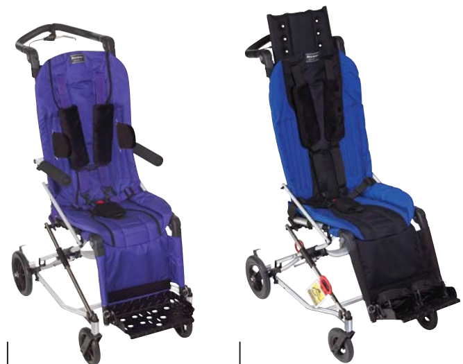
One Color Rodeo