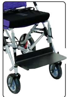
One-Piece Footplate (Standard)